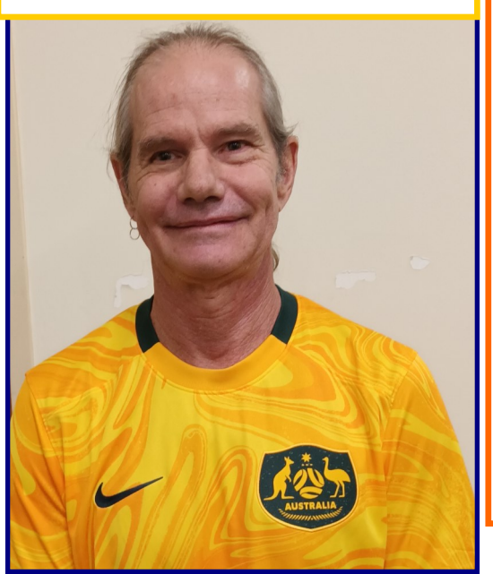
Anzac Day...... We have supported the service on Anzac Day at the Lobethal cenotaph 6 am, will you be able to attend?